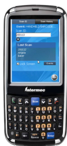
CS40 Window Mobile Device