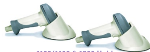
1100/1105 & 1200 Holder Can be used on tabletop or wall mounted